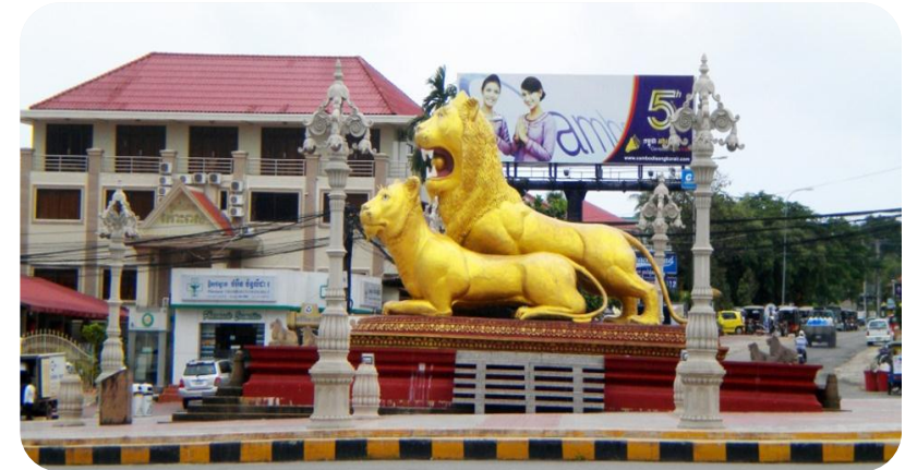
SIHANOUKVILLE’S LANDMARK: The Golden Lion Roundabout situated near the Ochheuteal Beach