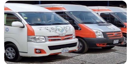
BUSES & VANS