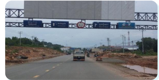
ROAD TO SIHANOUKVILLE

AIRLINES: Most local airlines have direct and connecting flights. AirAsia airline also operates direct flights from Kuala Lumpur. Moreover, there is a probability to connect with Bangkok.