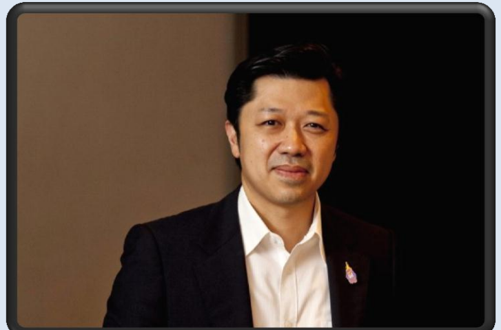
Suphachai Chearavanont CEO of Charoen Pokphand Group